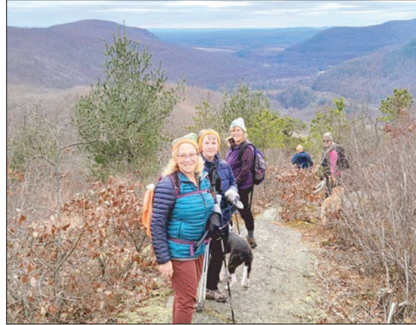
Hilltown Hikers head down the trail during a hike on Unkamit's Path.