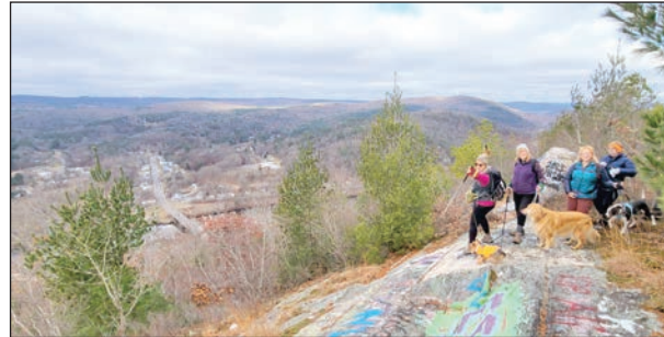
Hilltown Hikers and their canine companions enjoy the view overlooking Russell.