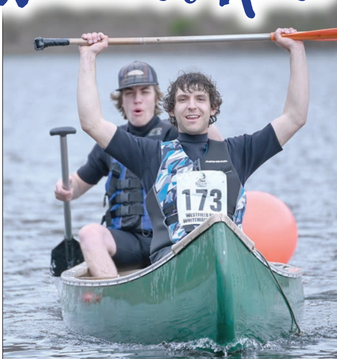
Racers finish the Classic in Woronoco.