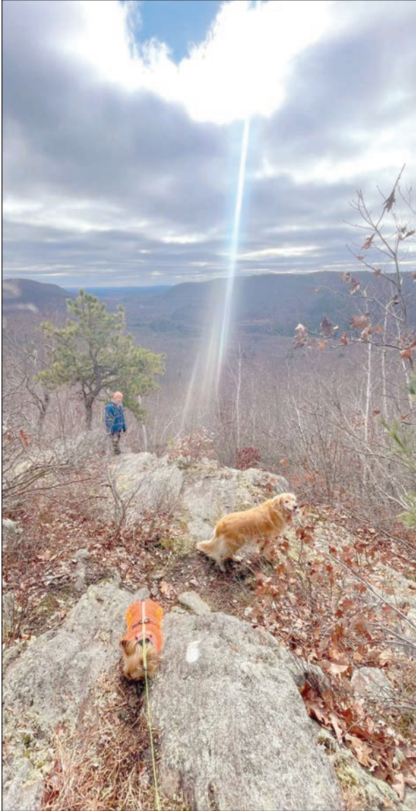
Cybil and Betty, expert hiking dogs, enjoy the rocky ledge.

the favorite vistas at the boulders giving the Western Massachusetts Hilltown Hikers west, south and east bound views. Once across the ridge the trail drops into the Shatterack Brook Valley with its mountain waterfalls, seven mile loop coming back through Hull Lumber. Maps are available by visiting www.hilltownhikers.com .